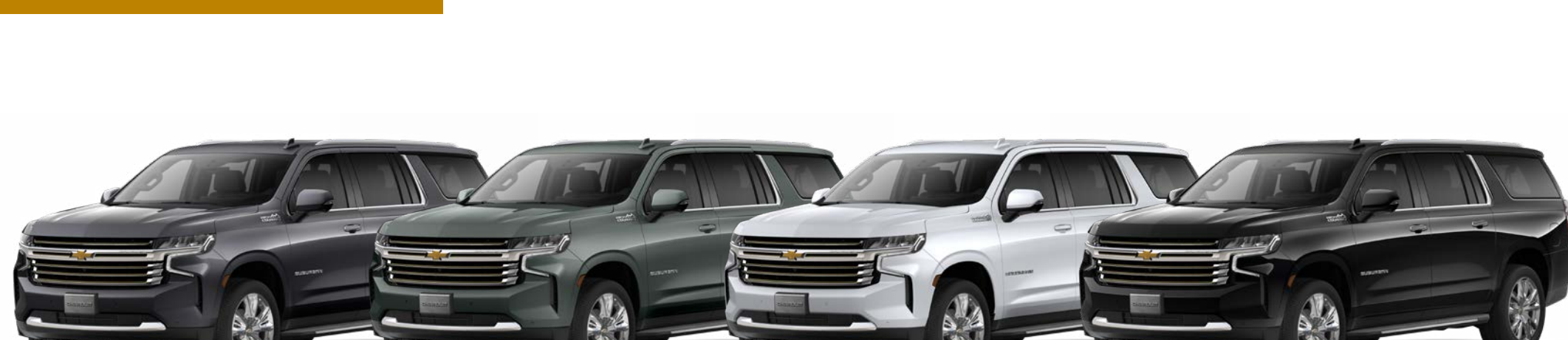
Rush Met Metallic Olive Tree Summit White Black