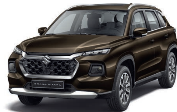
Cave Black Pearl