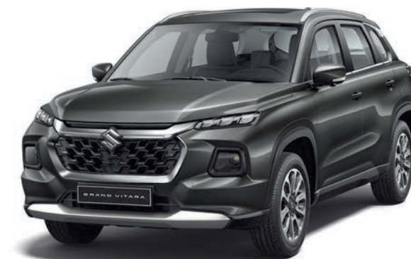
Grandeur Grey Pearl Metallic