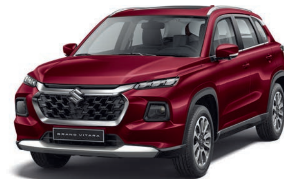
Opulent Red Pearl Metallic