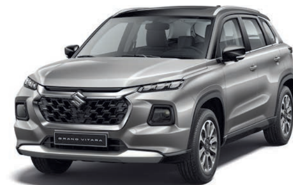
Splendid Silver Pearl Metallic