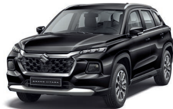
Midnight Black Pearl