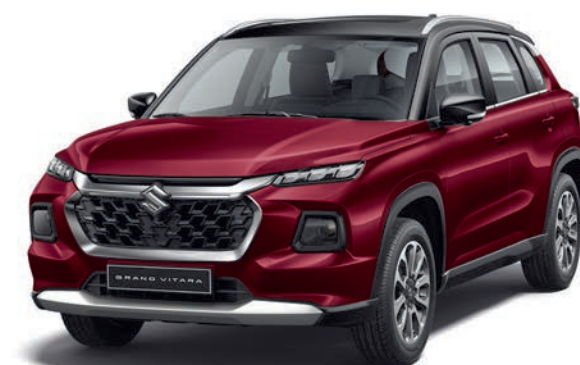
Opulent Red Pearl Metallic