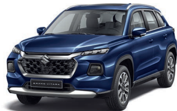
Celestial Blue Pearl Metallic