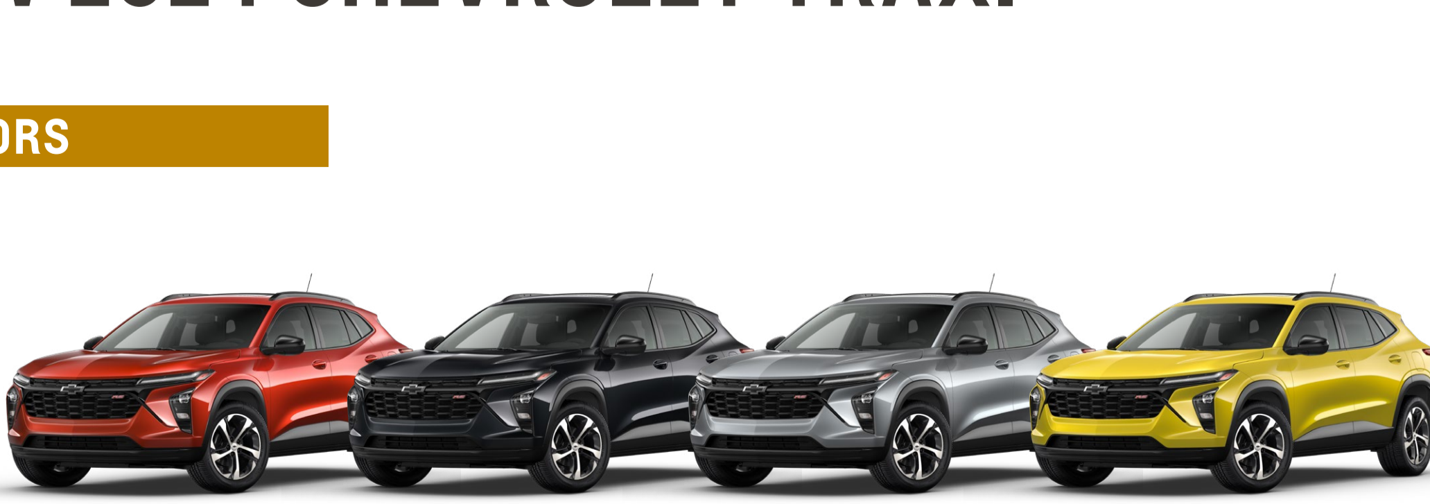
Orange Metallic Black Metallic Shark Gray Yellow Metallic†