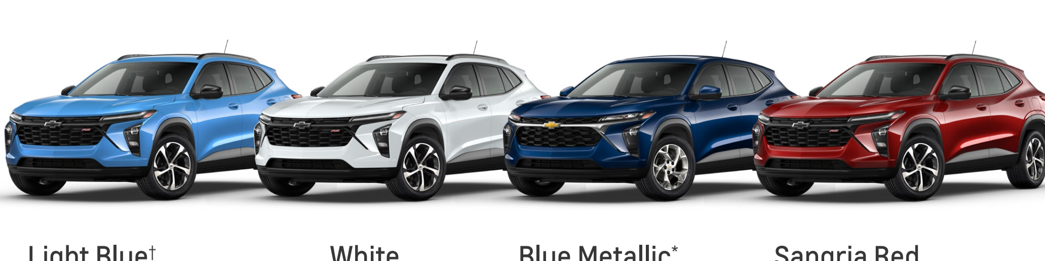
Light Blue* White Blue Metallic* Sangria Red