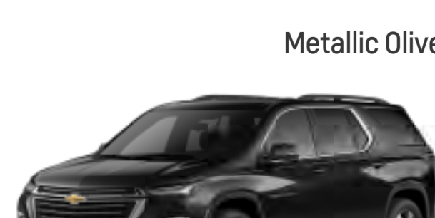
Black Graphite Metallic