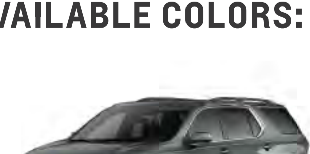
Metallic Olive Tree