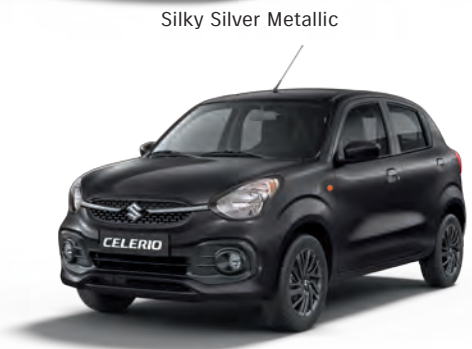
1,430mm (165/70R14) 1,440mm (175/60R15)