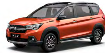
Rising Orange Pearl Metallic × Cool Black Pearl Metallic