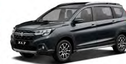
Cool Black Pearl Metallic