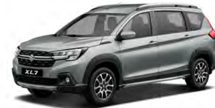
Magma Gray Metallic