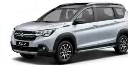
Snow White Pearl × Cool Black Pearl Metallic