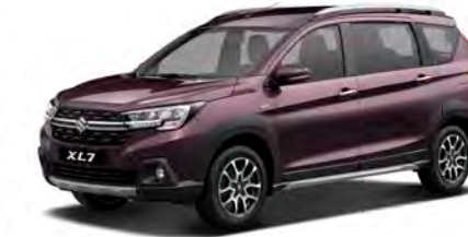
Burgundy Red Pearl