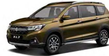
Brave Khaki Pearl