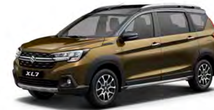
Brave Khaki Pearl × Cool Black Pearl Metallic