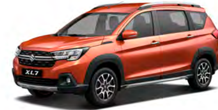
Rising Orange Pearl Metallic