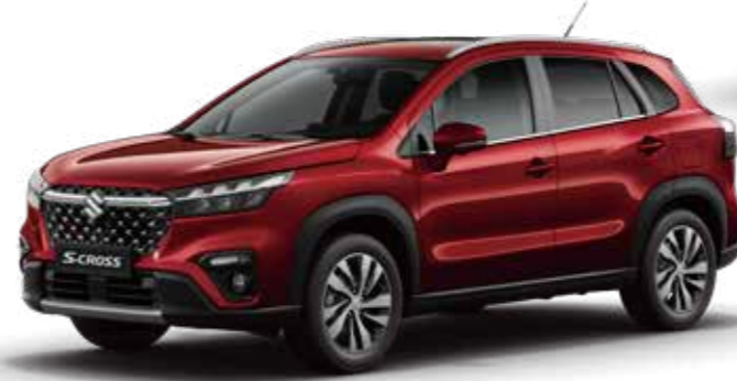
Energetic Red Pearl