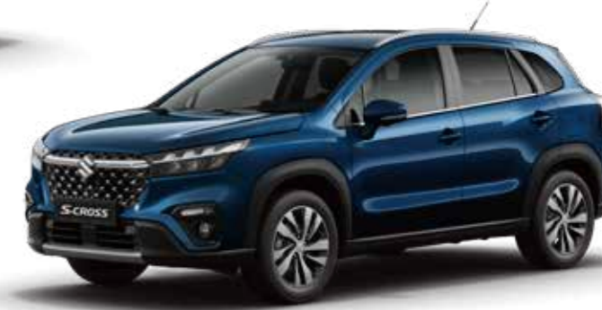
Sphere Blue Pearl