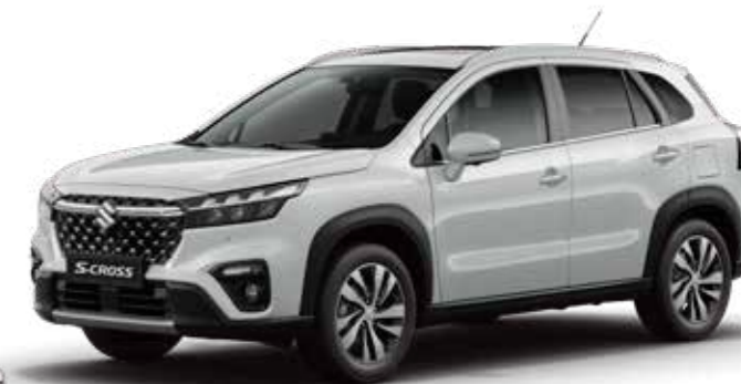
Cool White Pearl