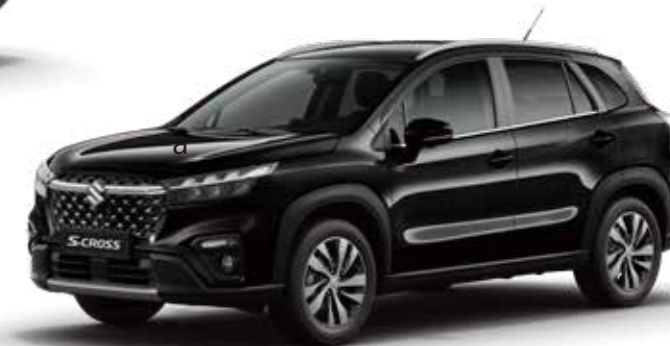
Cosmic Black Pearl Metallic