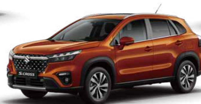
Canyon Brown Pearl Metallic