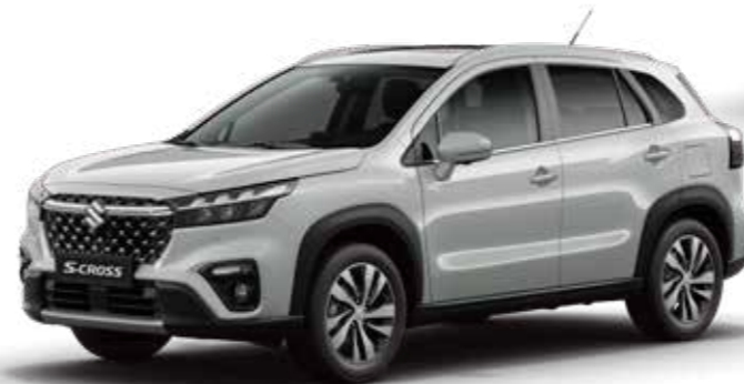
Silky Silver Metallic