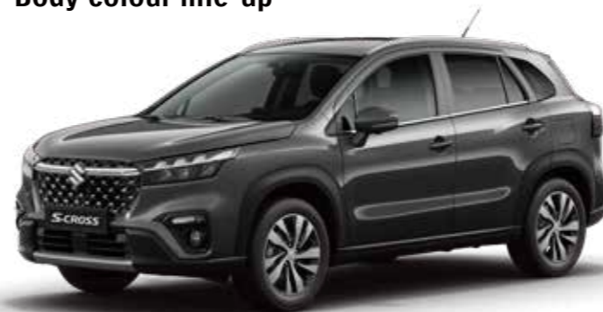
Titan Dark Gray Pearl Metallic