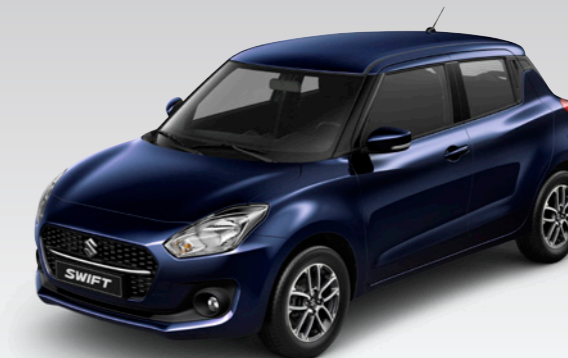
Midnight Blue Pearl Metallic