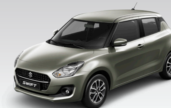
Magma Gray Metallic