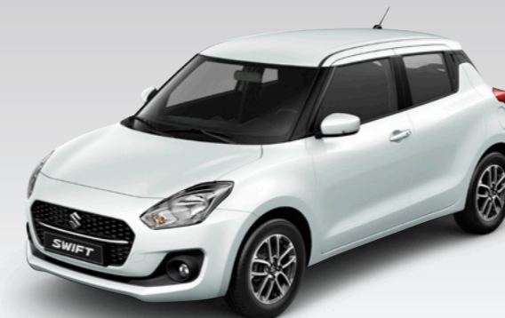
Arctic White Pearl