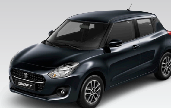
Midnight Black Pearl