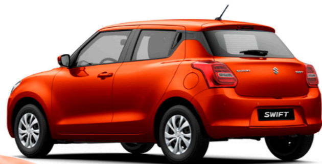
Lucent Orange Metallic