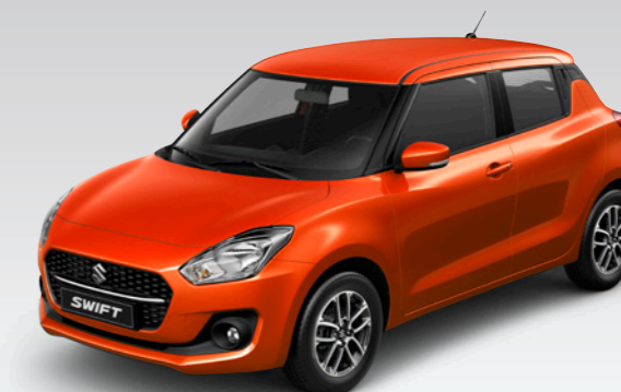
Lucent Orange Metallic