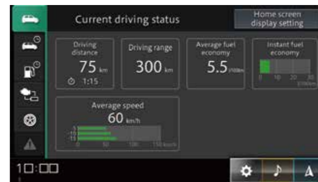
9-inch display audio on GLX

The display audio features the latest in digital convenience, including Apple CarPlay®, Android Auto™, voice recognition and hands-free Bluetooth® calling. Standard features also include radio, music and movie USB, iPod and Bluetooth® music playback. Keeping you in-tune with the vehicle, it also displays information such as fuel economy, driving range, warnings, rear-view camera, 360 view camera. The GL is standard equipped with a 7-inch WGA display, while the GLX features a 9-inch HD display.