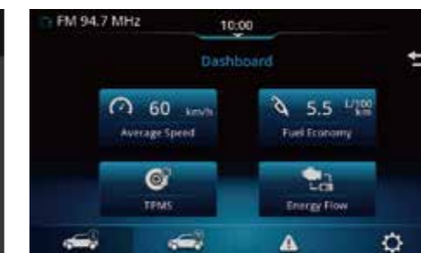
7-inch display audio on GL